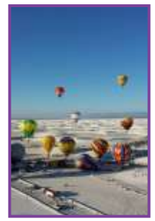
View from high above the 2016 White Sands Balloon Invitational